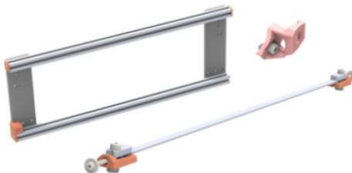
Figure 2. Selected components of the frame

From a functional point of view, the machine frame is the part of the machine which not only allows the distribution of all other functional groups of the machine in space but must also absorb all the reactions in the bearing arrangement of the drive members by its internal forces. These reactions are generally periodically variable; they can be the excitation forces of the frame oscillation. The frame must be dynamically stable so that its natural frequencies are significantly higher than the forced oscillations and that no resonance occurs (Figure 2).