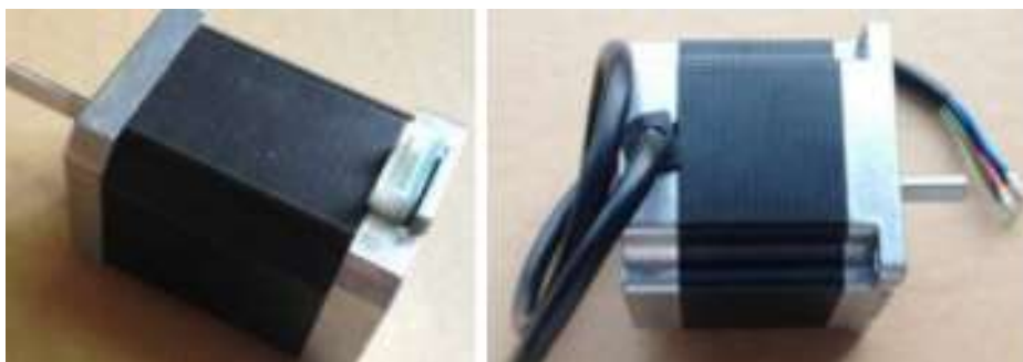
Figure 4. Stepper motors

To ensure accurate movement and reliability in conjunction with accuracy, stepper motors are implemented in the CNC machine (Figure 4). Stepper motors are synchronous motors that are controlled by a uniform current. Rotation of the rotor by a certain step is ensured by a pulse that induces a magnetic field. According to its design is given the number of steps it takes. The number of steps is determined by the number of pole pairs. Servomotors are the second most common variant in the design of CNC machines. These motors have feedback and can handle the high overload. Stepper motors were applied to each axis to create consistency between frame, motor and electrical equipment.