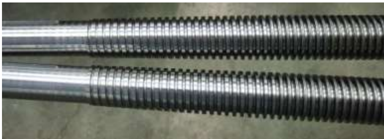
Figure 3. Trapezoidal screws

To ensure accurate movement and reliability in conjunction with accuracy, stepper motors are implemented in the CNC machine (Figure 4). Stepper motors are synchronous motors that are controlled by a uniform current. Rotation of the rotor by a certain step is ensured by a pulse that induces a magnetic field. According to its design is given the number of steps it takes. The number of steps is determined by the number of pole pairs. Servomotors are the second most common variant in the design of CNC machines. These motors have feedback and can handle the high overload. Stepper motors were applied to each axis to create consistency between frame, motor and electrical equipment.