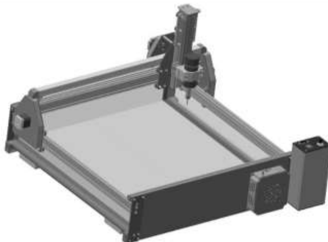
Figure 6. 3D model of the elected representative's machine